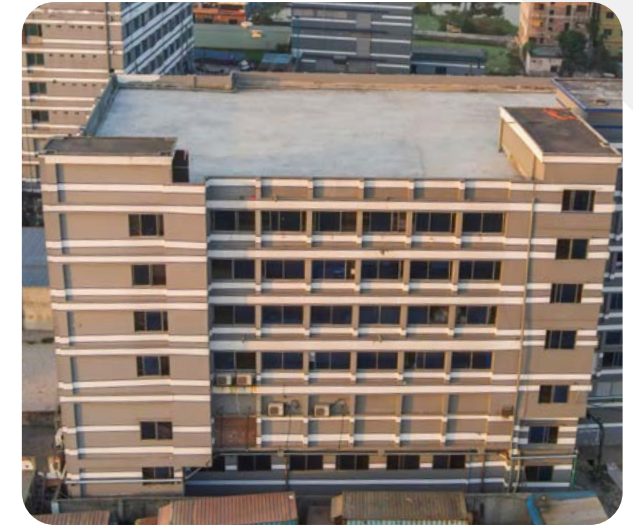
PATRIOT PACKAGING INDUSTRY ( Packaging Unit )