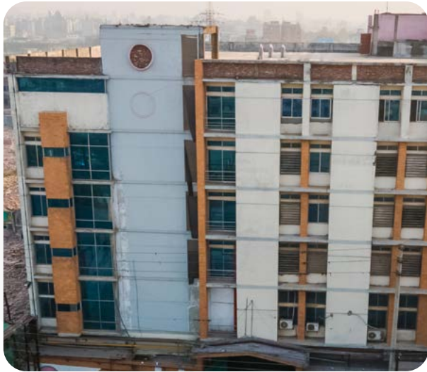
SAKURA DYEING & GARMENTS LTD. ( Garments Unit )