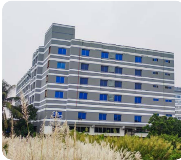
S.B KNIT COMPOSITE ( Dyeing, Printing & Lingerie Unit )